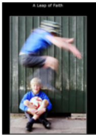
2024 Primary School Winner